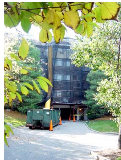
The work begins..... Club West

Club West - First phase of a work on the exterior of the building. Siding will replace present façade.